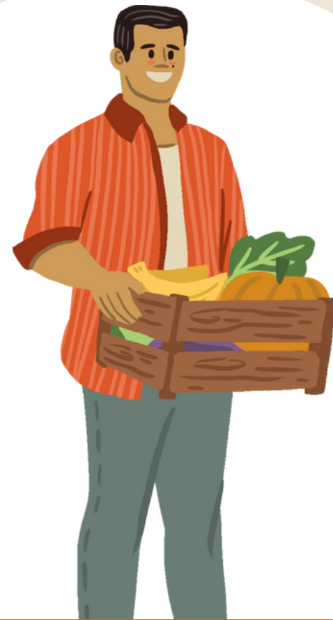
Transportation & Distribution