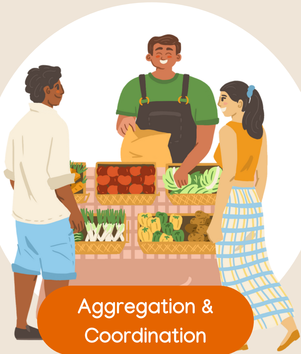
Aggregation & Coordination