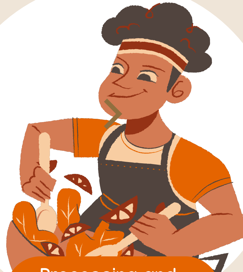
Processing and preservation